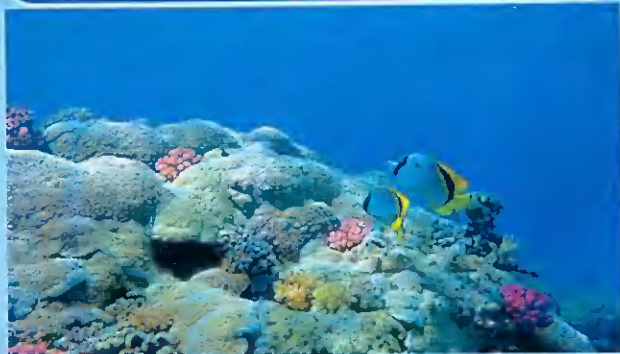
Hurghada, Egypt - Lonely Planet

Nanoscience & Nanotechnology Center Nottingham University, UK